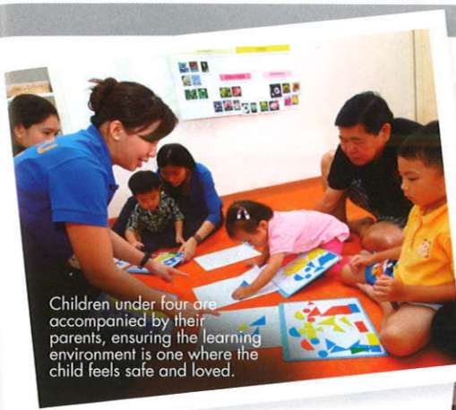
Children under four are accompanied by their parents, ensuring the learning environment is one where the child feels safe and loved.